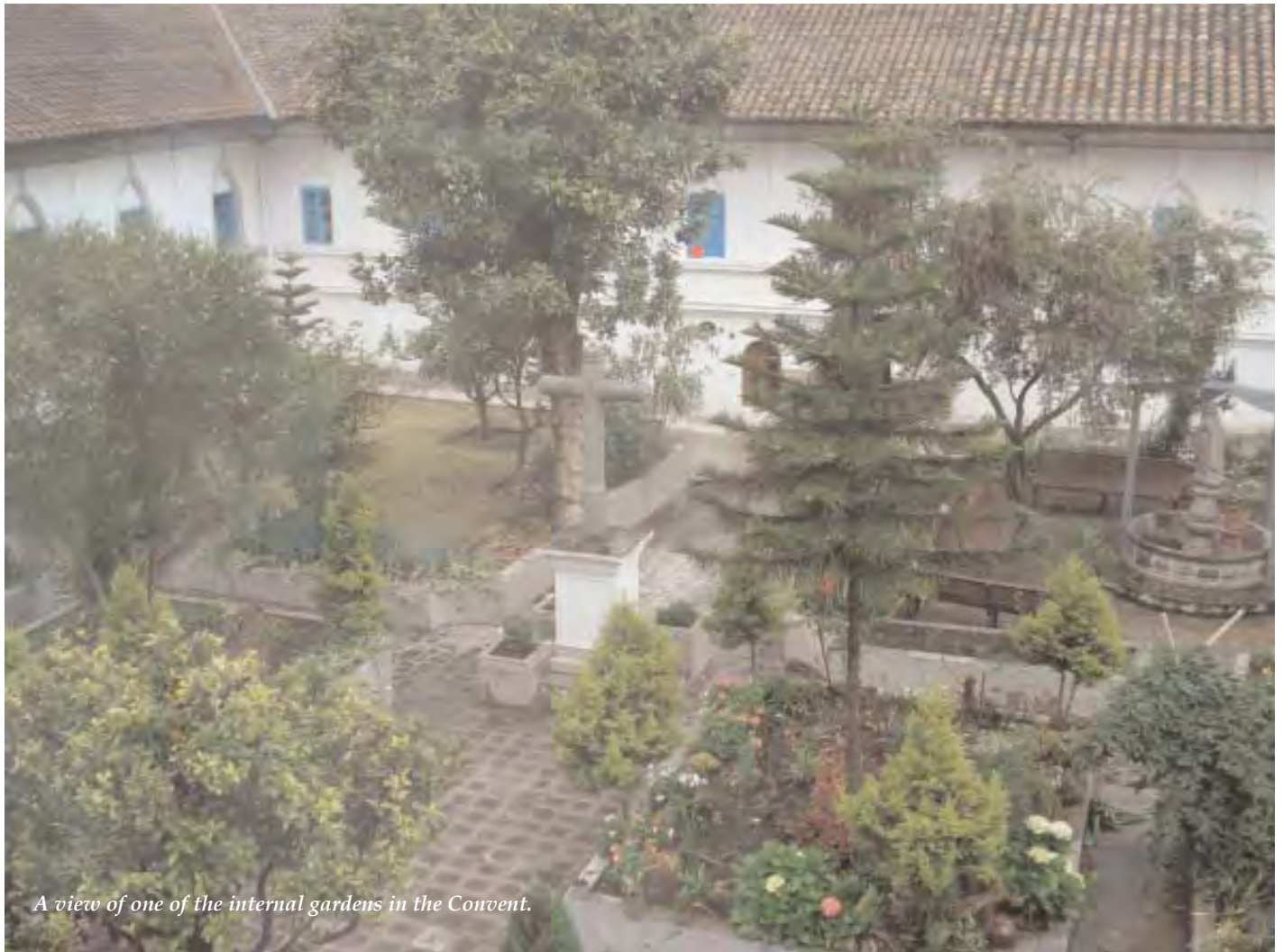
A view of one of the internal gardens in the Convent.