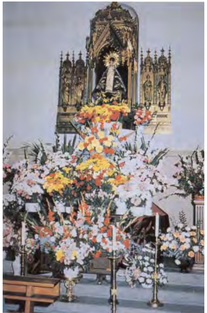
During the annual feast day in honor of Our Lady of Good Success , that is held on the last Sunday of October, it is a custom to make a floral offering before the sacred Statue of Our Lady of Good Success .