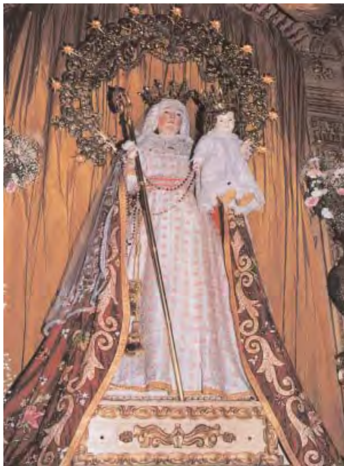
Our Lady of Good Success venerated in the Convent of the Immaculate Conception of Quito.

“My Lady, I entrust to your maternal love my sons and daughters of the three Orders I founded, that continue on their earthly pilgrimage. I deliver to you today and for all times this Convent established under