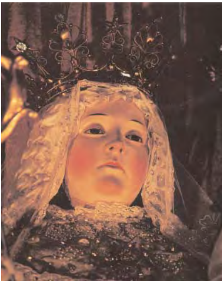
Countenance of Our Lady of Good Success venerated in the Convent of the Immaculate Conception of Quito.