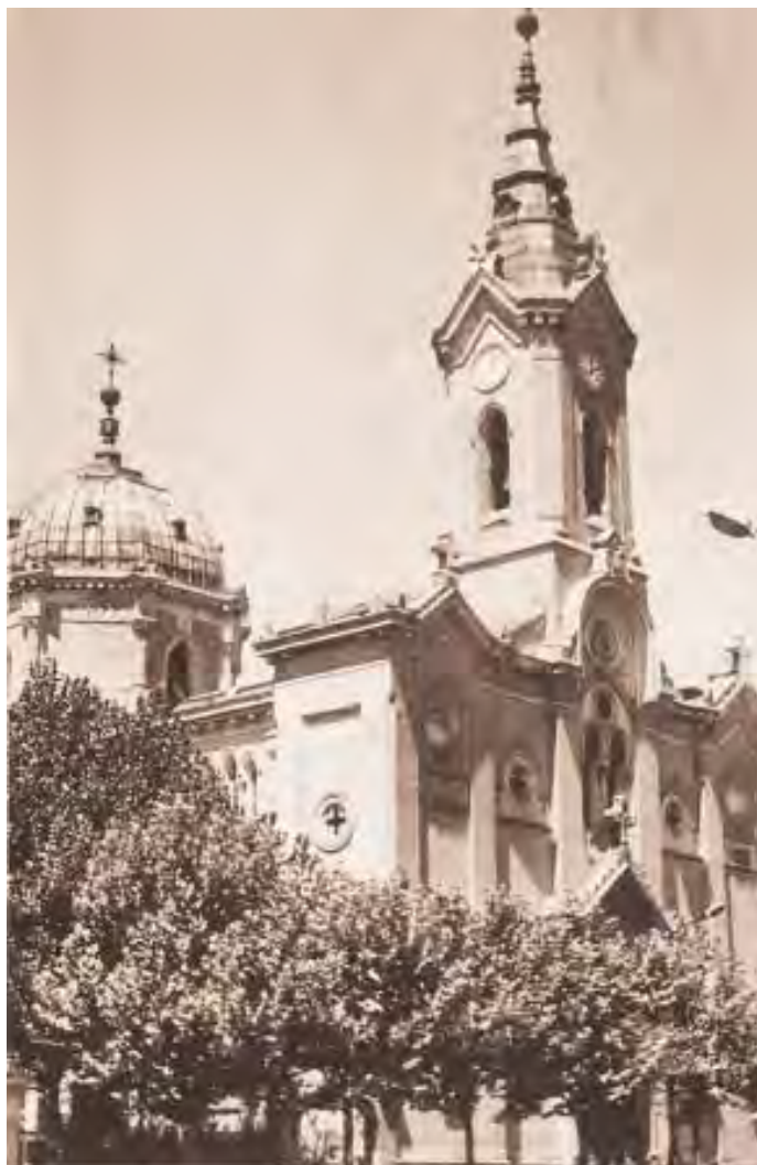
View of the Church of Good Success, ordered by Queen Isabella II of Spain, and built in Madrid, in 1868, in "Via de la Princesa", before the "Hospital Central del Aire" (Military Hospital).

Pope Paul V received the two Brothers and heard the story of the discovery of the Statue. Understanding the supernatural nature of the event, He knelt down, put his pectoral cross around the neck of the Statue, embraced and kissed Her and exclaimed: «Look, She smiles! Why is She smiling? What a Good Success you have achieved with this trip! There is no doubt that Our Lady has decided to protect you and support you in your work. So I am not the one to go against Her. May your wishes have a Good Success! ».