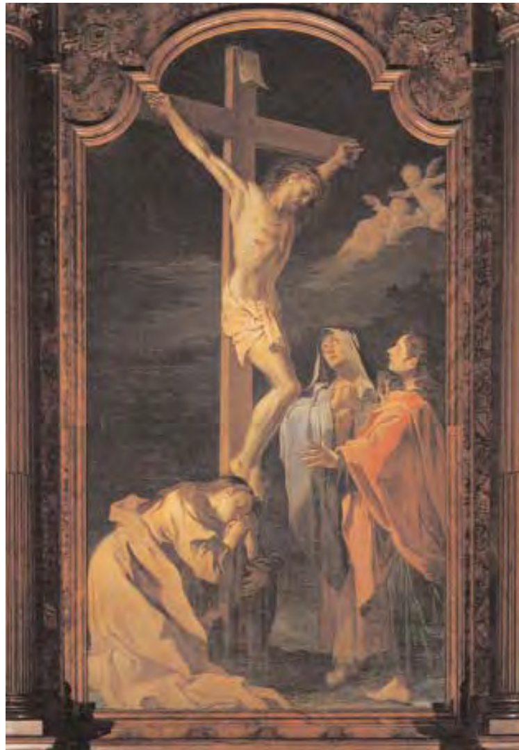
Jesus in agony, with the Virgin Mary, St. John and St. Mary Magdalene at the foot of the Cross.

«Have a great love for the Blessed Virgin. Imitate her virtues, above all, her profound humility and her ardent love for God and poor sinners. Love each other with a childish simplicity and innocence that permits no falseness of hypocrisy in your souls. Conserve and propagate the devotion to Our Lady under the tender invocation of Good Success, so that She might obtain whatever you ask of Jesus and Mary . You should also take supreme care of your great treasure and strive to make Her known and loved by the greatest number of souls possible, assuring them that with this devotion they will always attain good success in time and in eternity...» .