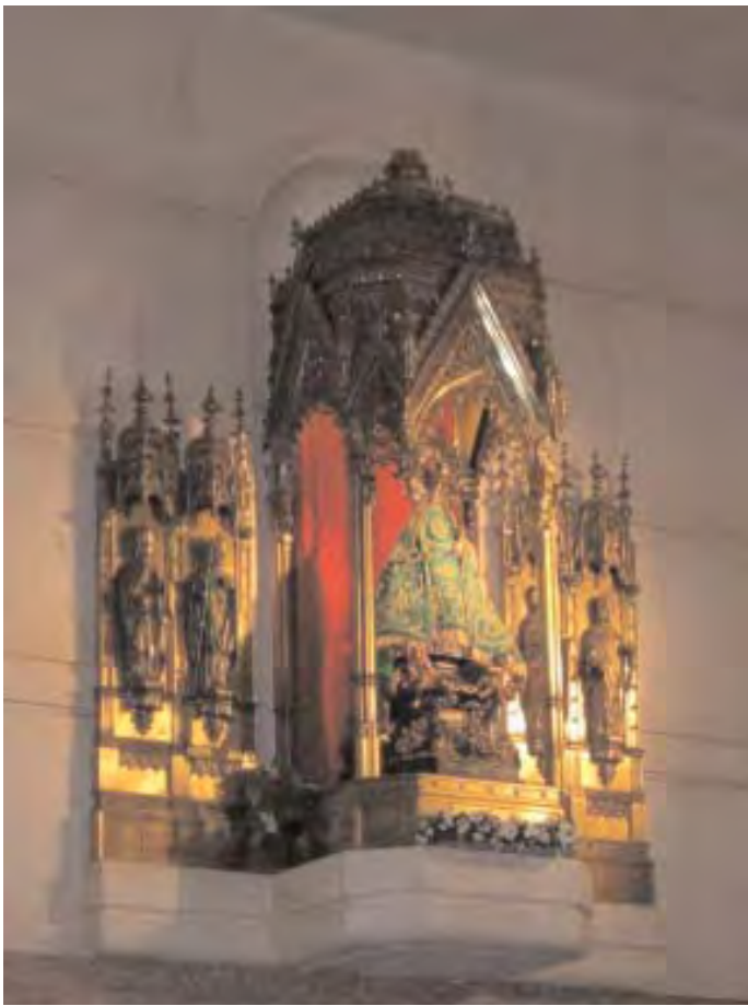
View of the sacred Statue of Our Lady of Good Success , located above the side altar of the Church of Good Success at the " Hospital Central del Aire " (Military Hospital) of Madrid.

On June 6, 1611, King Philip II made the dedication of the new church and, in the presence of the Queen and the whole Court, placed the Statue of Our Lady of Good Success in the church, above the third chapel. Then, on September 19, 1641, with a solemn ceremony, the sacred Statue, which gave its name to the Hospital of the Court and to its church, was placed above the main altar.