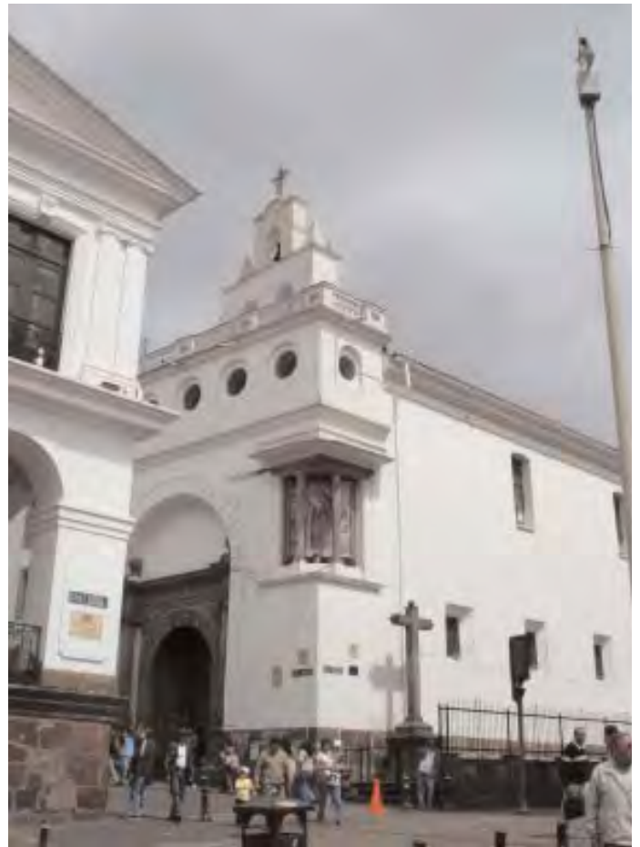
Main entrance to the Church of the Immaculate Conception in Quito, where Our Lady of Good Success is publicly venerated three times a year.

Our Lord addressed her, saying: «My Spouse, I desire for you a life of immolation. Your life will be a continuous martyrdom» .