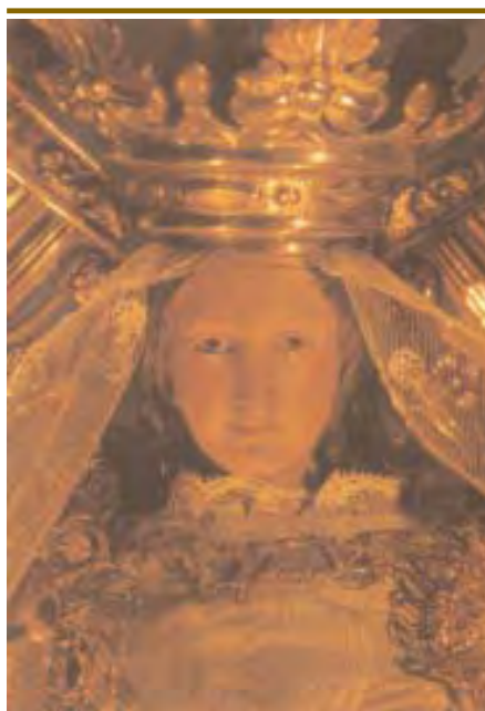
Countenance of the Statue of Our Lady of Good Success placed above the main altar of the church dedicated to her, in Madrid.

At the age of seven, a fire broke out in the church destroying it and damaging her house and paternal property, precipitating the family into poverty. The parents of the young girl found themselves obliged to leave Viscaya and to relocate themselves and their three children to Santiago of Galicia, in the north-western part of Spain.