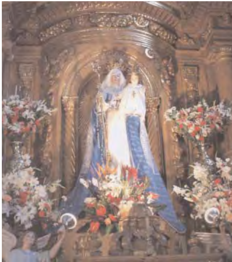
Our Lady of Good Success in the niche about the altar. She is publicly venerated during the Novena January 24 th / February 2 nd .

This took place at 3 o'clock in the morning».